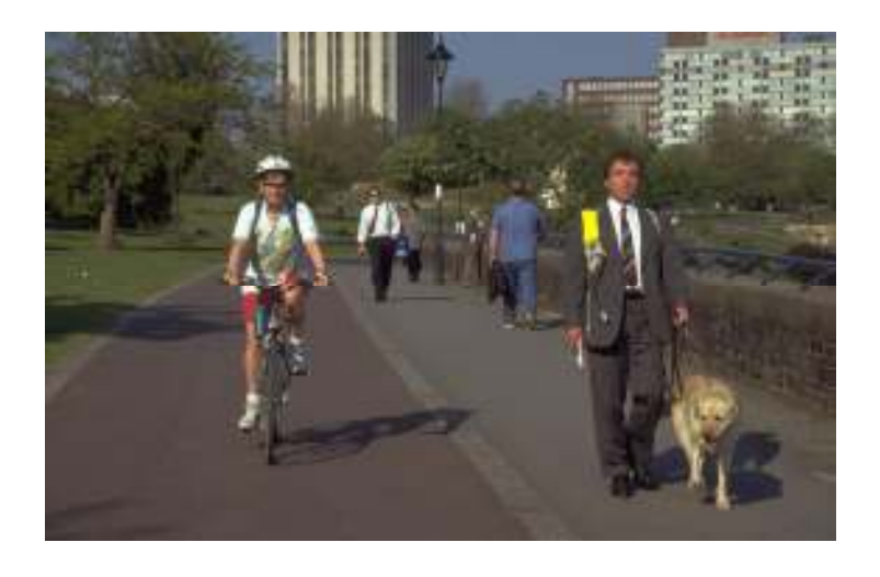
Visually impaired walker with guide dog & cyclist on segregated traffic free path, Castle Park, Bristol, National Route 4

2.6 In 2008 Guide Dogs for the Blind Association (GDBA) objected to the Sustrans initiative, as they wish to see separate paths for pedestrians and cyclists on any future traffic-free routes, something that Sustrans has difficulty in assenting to. Most of Sustrans' paths provided to date as part of the National Cycle Network have been traffic-free paths without segregation, although some sections are segregated, most commonly in urban areas.