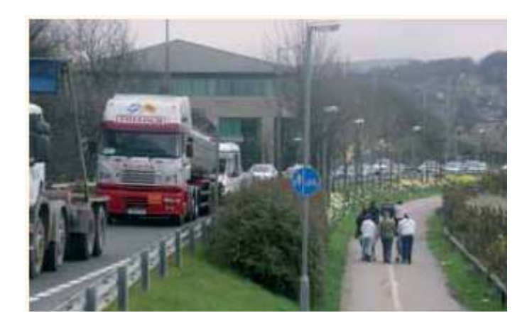
Group of pedestrians using the whole of a segregated path, Lancaster

7.21 The behaviour of cyclists and pedestrians, when they encounter one another, was analysed. It was found, as in other research, that cyclists reduce their speeds substantially when they encounter pedestrians, but the same effect was found when cyclists met other cyclists. Interestingly, pedestrians tended to increase their speed when they met other users. Cyclists tended to keep to their left when meeting others coming towards them but would pass others either on the right or left. Pedestrians show no preference for passing on the left or right. This is perhaps unsurprising as pedestrians are generally not required to follow markings when using footways and footpaths.