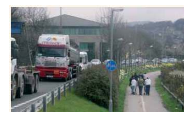
Group of pedestrians using the whole of a segregated path, Lancaster

several studies of the problem of pedestrians not keeping to the part of path designated for their use on segregated facilities.